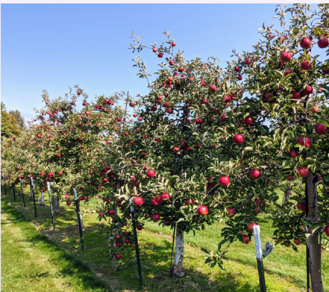
Hillside Orchard and Farm Market